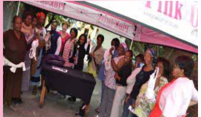
Above: Women showing off bras given to them by PinkDrive team

PinkDrive wasted no time but started the New Year off with a fun and meaningful activity at the Gugulethu Community Health Clinic. During this event, 20 medically uninsured women in the community received free mammograms on the PinkDrive Mobile Mammography Unit.