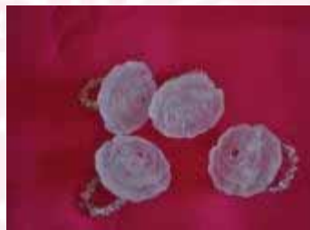
Flower ring with a crystal

“What lies behind us and what lies before us are tiny matters compared to what lies within us” Ralph Waldo Emerson