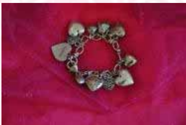
Heart Charm Bracelet