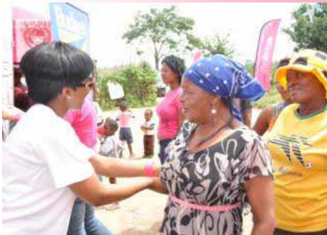
Above: one of the women being measured for her correct bra size

“We really appreciate this, we knew nothing and today we know a lot” said one of the ladies who visited the PinkDrive mobile clinic. In one day more than 120 women were educated; breasts examined and were given free bras.