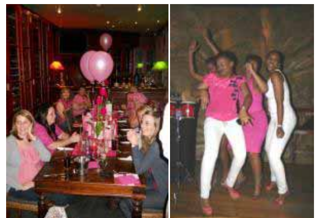
Above right: Ladies enjoying the entertainment Left: Ladies dancing to the music of the in house band