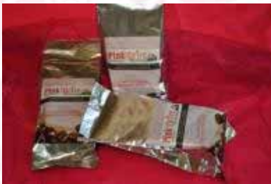
PinkDrive Filter Coffee