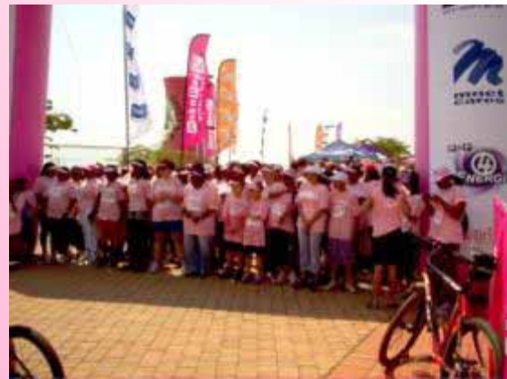
Pink champions at the Pick'n Pay walk Bloemfontein

For more information on the Pick n Pay walks please visit http://www.pinkdrive.co.za/articles/Pick-n-Pay-Women%27s-Walk---Cape-Town.html?articleID=277