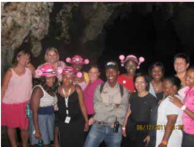
Above: M-Net and PinkDrive team at the Maropeng Caves