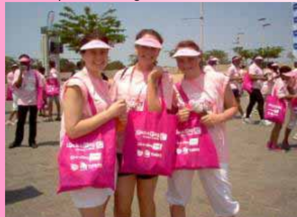
Above: Ladies happy to get their goody bags