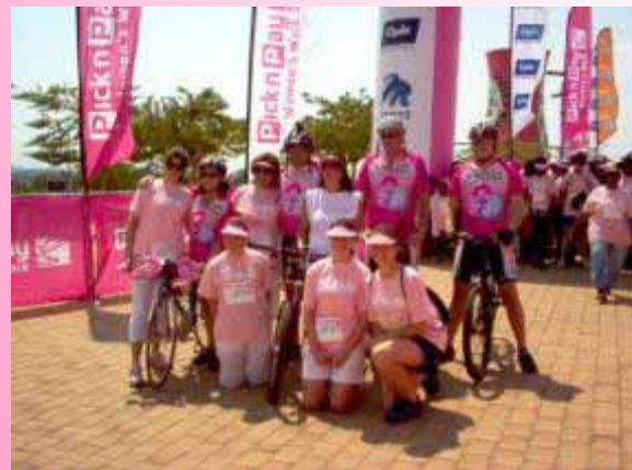
Above: Cyclists leading the walkers