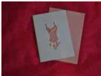
Assorted Handmade cards