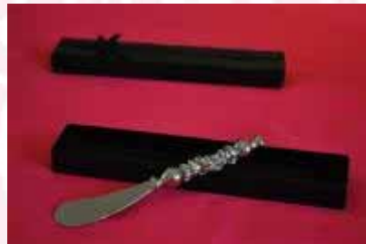
Butter Knife or Cake lifter in a gift box